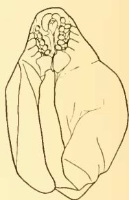
FIG. 2.— COLOPHRYXUS NOVANGLIE. ADULT FEMALE. VENTRAL VIEW. X 7½.

In the indistinct segmentation of the abdomen of the male this genus is more closely related to Aspidophryxus Sars, a Prodajus Bonnier, and Arthropryxus Richardson b than to the other genera of Dajidae. The absence of pleopoda brings it closer to Arthropryxus . The female, however, differs from the female of Arthropryxus in the unsegmented abdomen.